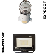
Internal and External Lighting