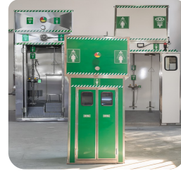
Insulated Panels and Spring-Loaded Doors