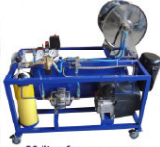
80 liter for one person

WITH FULL FACE MASK AND BREATHING AIR FILTER, FOR EMERGENCY SITUATIONS WITH SPARE AIR CYLINDER