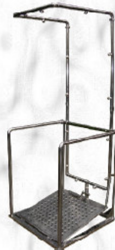
Decontamination shower with support