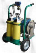
6,8 liter -300 bar for one / two person