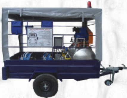
350 liter for four person