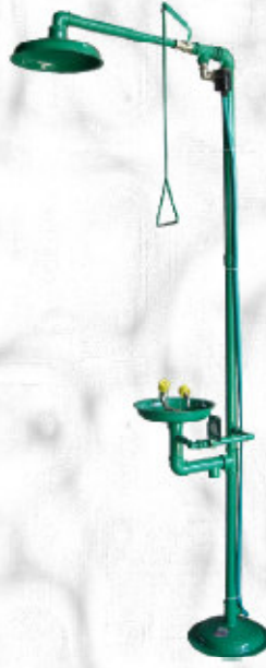
Freeze Proof with automatic valve