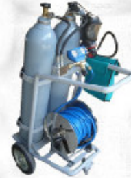
50 liter - 200 bar for one / two person

İSTAIR® is a registered trademark of İST İşçi Sağlığı Teçhizatı San.Tic. Ltd. Şti.