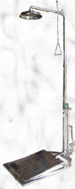
Freeze Proof with Double valve