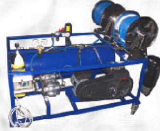
150 liter for two person