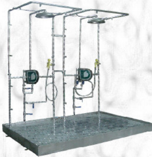
Twin Decontamination shower system